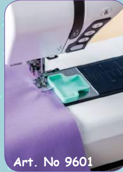
Art. No 9601

Sew accurate seams every time! The Seam Guide is a one piece reusable and repositionable adhesive guide for perfect straight stitching, curves and top-stitching. It is about 5/16 in. (8mm) thick for easy fabric guiding. Features a handle grip for ease in attaching and removing and a washable adhesive guide underside.