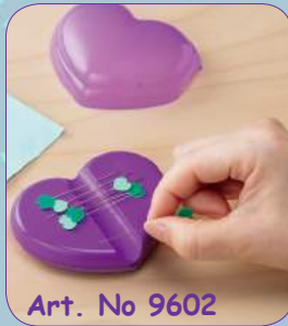
Art. No 9602

This heart-shaped addition to our collection of pin caddies makes for an ideal first pin caddy. The Magnet Pin Caddy gathers and stores pins facing in one direction. Center groove allows for easy pick up. Includes a cover for safe storage.