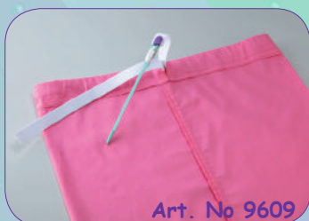
Art. No 9609