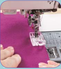
Art. No 9600