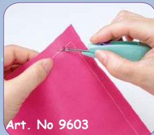
Art. No 9603

Note from Team Nancy: Comfortable feel and easily cuts stitches.