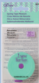
Art. No 9610

P.O. Box 3850 Ontario CA 91761 www.clover-usa.com Toll: (800)233-1703 Fax: (909)218-2161